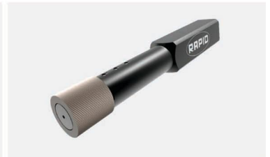
Internal knurling tool holder