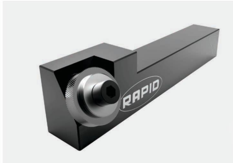
C101 Single Cut Fixed Head Tool Holder Shank Size : 21.5 X 28