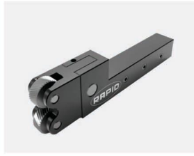
F204 CNC Double Tool Holder Shank Size : 25 X 25 / 20 X 20