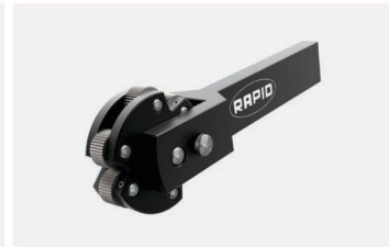
Six wheels knurling tool holder