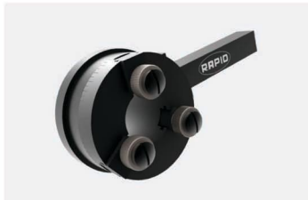
Pipe knurling tool holder