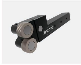
F205 CNC Double Shoulder Tool Holder Shank Size : 25 X 25 / 20 X 20