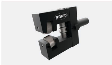
Taper knurling tool holder