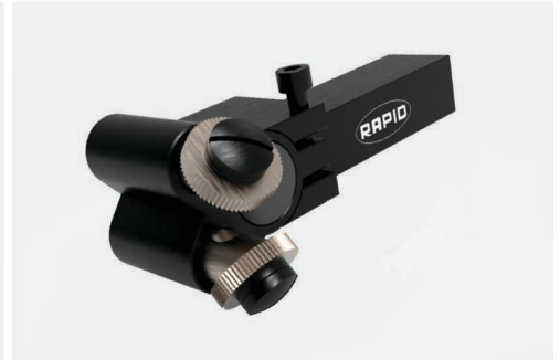
C201 Double Cut Heavy Load Tool Holder Shank Size : 21.5 X 28