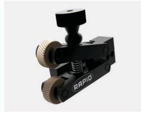
S201 Mini Straddle Tool Holder Shank Size : 10 X 10