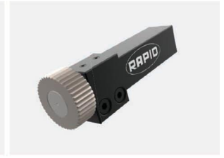
Tf101 Face Knurling Tool Holder Shank Size : 25 X 25 / 20 X 20