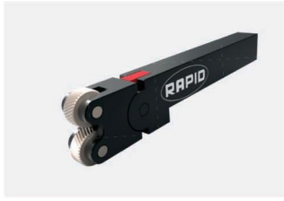
F202 Lathe Double Tool Holder Shank Size : 25 X 25 / 20 X 20