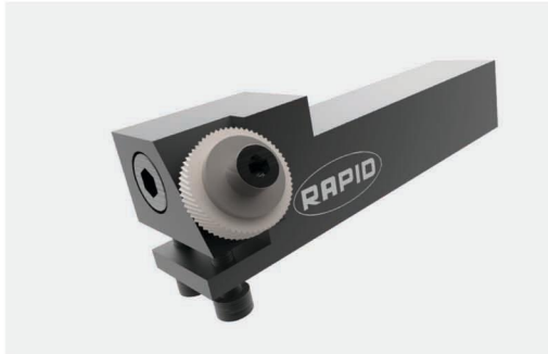
C102 Single Cut Moving Head Tool Holder Shank Size : 25 X 25 / 20 X 20